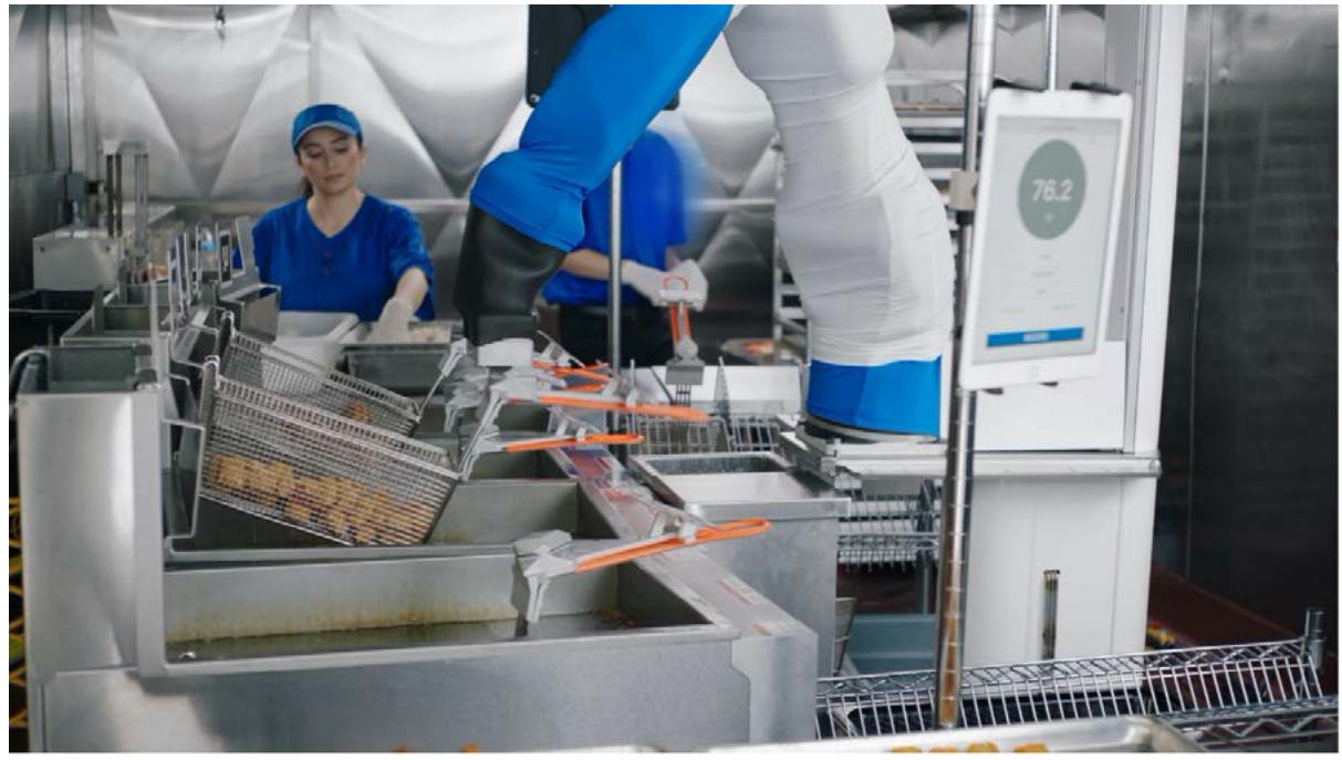
'Flippy', an autonomous robotic kitchen assistant that can learn from its surroundings and acquire new skills over time. Shown at work in a kitchen alongside 'co-workers' helping to fulfil customers' orders.