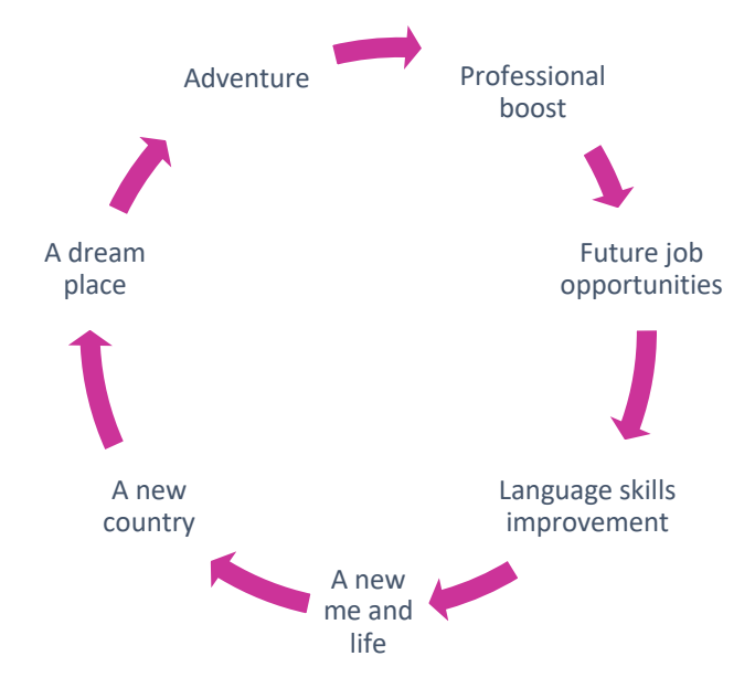
Figure 1. Students' expected impact from study abroad.

The questionnaire asked outgoing students about the expected impact that a study abroad experience might have on their professional and personal lives. Based on the data gathered and analysed, the following categories emerged as in figure 1: